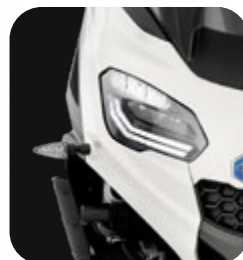
NEW FULL LED HORIZONTAL LIGHT CLUSTER