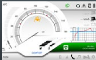
SMARTPHONE CONNECTIVITY (ONLY ON MP3 530 HPE E MP3 400 S)