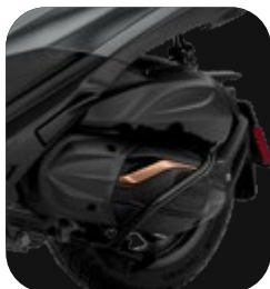
530 HPE EURO 5+ ENGINE