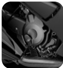
400 HPE EURO 5+ ENGINE