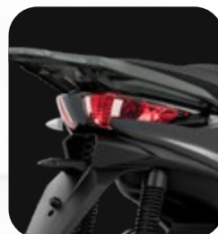
REAR LED LIGHT CLUSTER