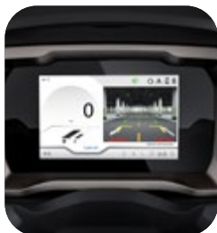
REVERSE AND REAR CAMERA