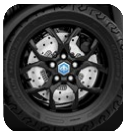
RIMS WITH A NEW DESIGN FEATURING FIVE SPLIT SPOKES