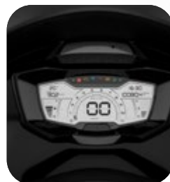
WIDE INSTRUMENT PANEL WITH 5" LCD DISPLAY