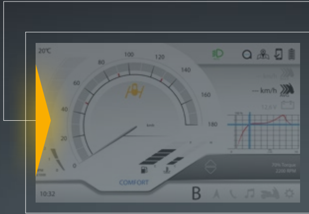
BLIS - BLIND SPOT INFORMATION SYSTEM (ONLY ON MP3 530 HPE)