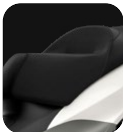
NEW COMFORT SADDLE