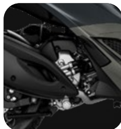
NEW 310 HPE EURO 5+ ENGINE