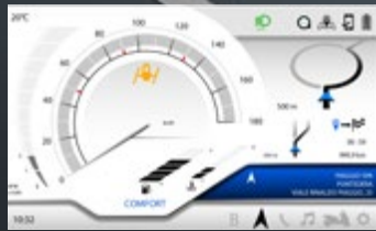
NAVIGATION SYSTEM (ONLY ON MP3 530 HPE E MP3 400 S)