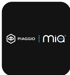
ADVANCED CONNECTIVITY WITH THE PIAGGIO MIA ON BOARD SYSTEM AS STANDARD