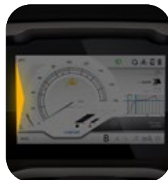
BLIND SPOT INFORMATION SYSTEM