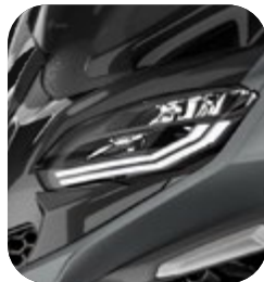
LED DRL HEADLIGHTS